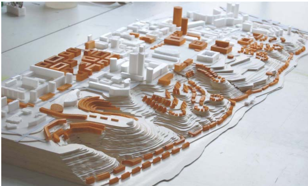
geospatial design model © as&p

It is planned to develop new residential and commercial areas on this embankment and to upgrade the adjacent urban areas and to develop a new city area on the opposite river banks. The geospatial master plan includes water supply, wastewater, stormwater, power, gas and district heating components.